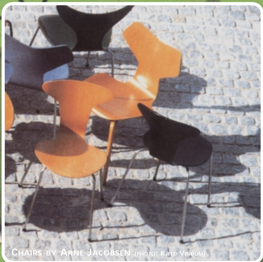
CHAIRS BY ARNE JACOBSEN

PROBABLY MOST WELL-KNOWN AND WIDELY CHERISHED IS HIS INDUSTRIAL DESIGN OF FURNITURE, CUTLERY, LAMPS AND TEXTILES.