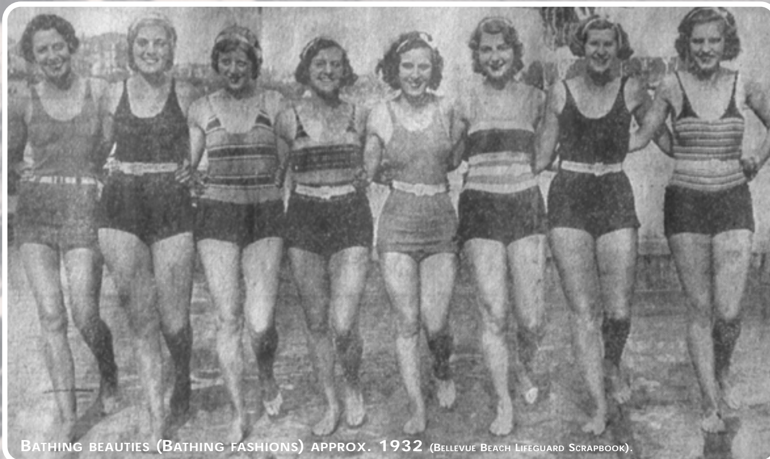
BATHING BEAUTIES (BATHING FASHIONS) APPROX. 1932 (BELLEVUE BEACH LIFE GUARD SCRAPBOOK).

THE BEACH IS A PUBLIC PLAYGROUND WHERE PEOPLE GATHER AND ARE AT EASE, SHARING THE HOPE OF A GLORIOUS FUTURE. YOU ARE COMPLETELY INDEPENDENT OF TIME AND PLACE, AND THEREFORE FREED FROM TIES TO THE PAST. INDEED A MODERN WAY OF LIVING.