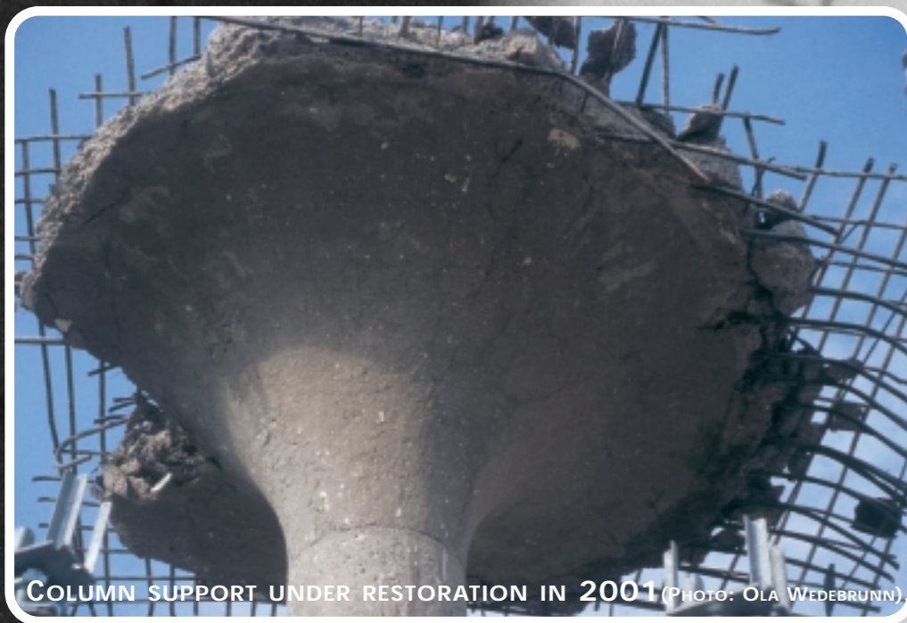
COLUMN SUPPORT UNDER RESTORATION IN 2001